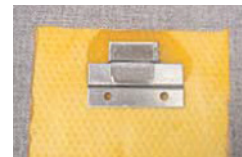
2-Part Mechanical Clips