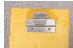
2-Part Mechanical Clips